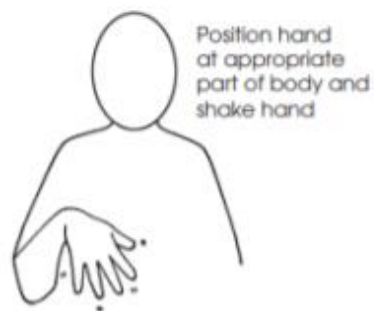
To Hurt/ Pain